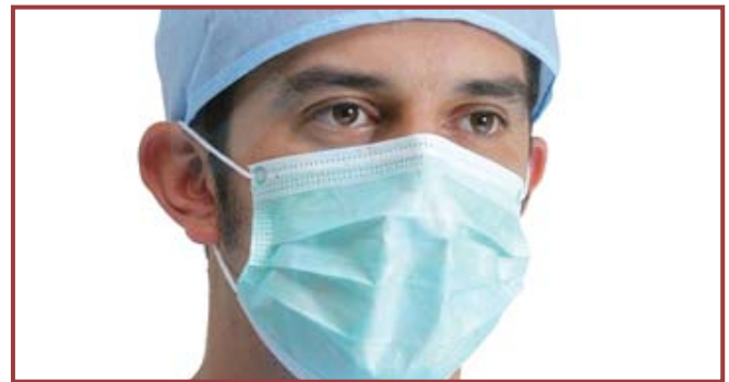
Figure 1: Health care worker wearing an N95 respirator.

PPE should be put on near the patient's room, in a clean room or a marked area in the hallway. Clean PPE should also be stored in this area. Before entering the area where PPE is put on, change into scrubs and ensure that a trained observer is available. Change into washable shoes, secure long hair or bangs, and ensure that all personal items (e.g., jewelry, pagers, and cell phones) have been removed. Enter the PPE donning area and visually check the integrity of the equipment. The trained observer will use a checklist to review the correct sequence of events and read aloud a description of the procedure for putting on PPE. Before handling any PPE, clean hands with an alcohol based hand rub. When hands are dry, put on the first pair of gloves. Next, sit down and put on boot coverings over washable shoes.