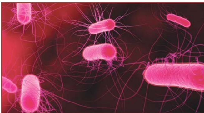
Figure 1: Clostridium tetani

The old woman was not taking neuroleptics or other drugs that can cause parkinsonism. Head CT scan showed no acute lesions, cerebrospinal fluid and serum calcium were normal. In view of the characteristic findings on neurological examination and history of infected skin ulcer we diagnosed tetanus and her son confirmed that she had not received a tetanus vaccine booster for 30 years. We gave a dose of intramuscular tetanus and diphtheria toxoid, intramuscular human tetanus immune globulin 500 IU, intravenous metronidazole 500 mg four times daily and clonazepam 0.7 mg three times daily via nasogastric tube and she had a repeat surgical debridement of the sacral ulcer. 1 week later her rigidity and spasms had reduced in severity and frequency. However, unfortunately she developed sepsis and died 3 weeks later. Blood cultures grew acinetobacter and enterococcus.