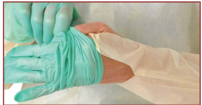
Figure 2: Removal of gloves.

Remove the outer gloves by grasping the glove on one hand with the other hand (Figure 2). Grasping the exterior of the glove at the wrist, pull the glove off of hand, with the contaminated exterior folded inside. Hold the removed glove in the double gloved hand. Slide a single gloved finger under the wristband of the remaining outer glove. Gently pull off the glove so that it is now inside out, forming a bag for the other glove and discard. Disinfect the inner pair of gloves. Remove the face shield. It is particularly important to avoid contamination of the eyes and mucous membranes when removing facial PPE. Tilt the head forward and lift the shield by the strap. Lift it above and away from the head without touching the shield itself and discard it in the biohazardous waste container.